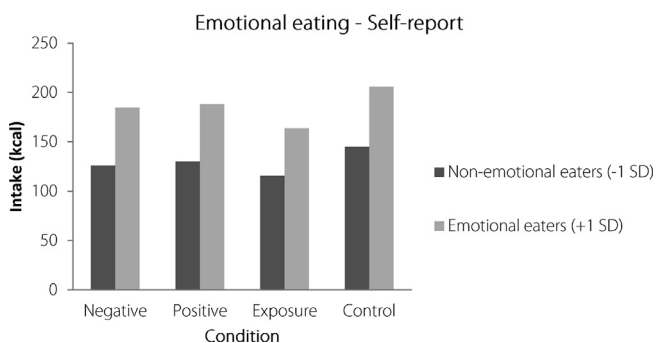
Fig. 2. Caloric intake of self-reported emotional (1 SD above the mean) and non-emotional eaters (1 SD below the mean) in the negative mood, positive mood, exposure and control conditions.

In the current study we aimed to investigate whether people who overeat after experiencing negative emotions (based on both self-report and actual intake) are not merely emotional eaters, but instead overeat after a variety of food cues. The high correlations among intake during negative emotions, positive emotions, and after food exposure support this idea: increased intake after negative emotions is associated with increased intake in response to other cues, both in self-reported emotional eaters and emotional eaters identified by actual food intake. In addition to this, we also made predictions with regard to emotional versus non-emotional eaters. More specifically, we expected emotional eaters to show increased food intake in every experimental condition compared to the control condition, while we expected no differences in food intake in any of the conditions in the non-emotional eaters. Furthermore, we hypothesized that in all experimental conditions, but not the control condition, emotional eaters would consume